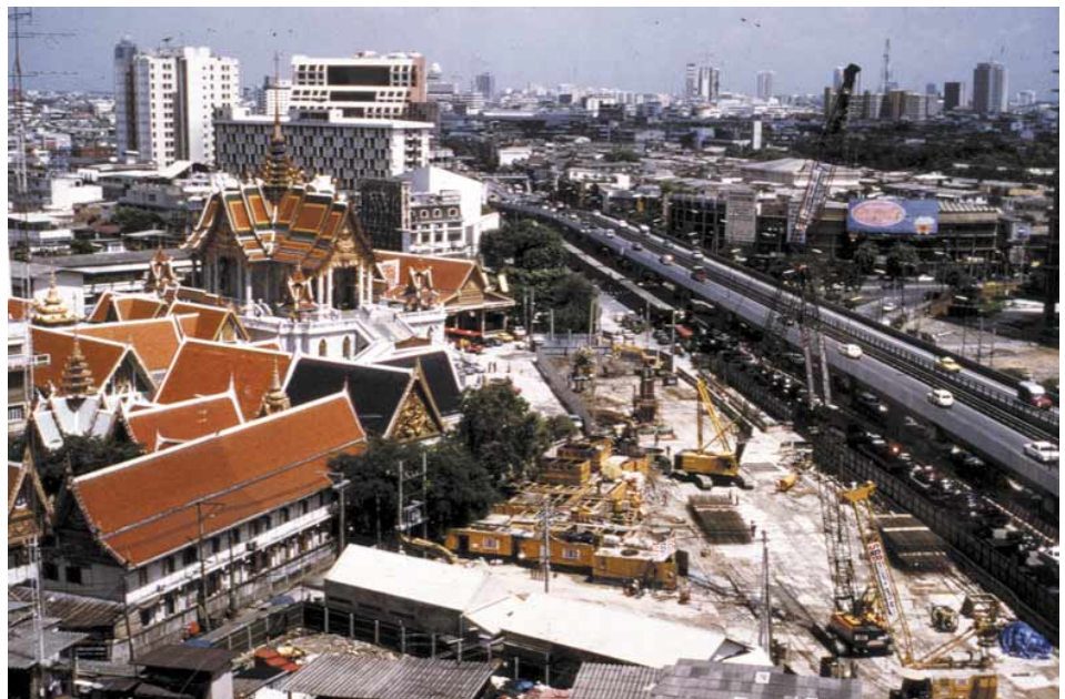
View of work at Samyan station