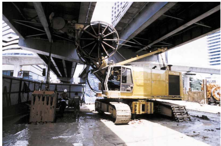
"Short KS" excavating under a flyover