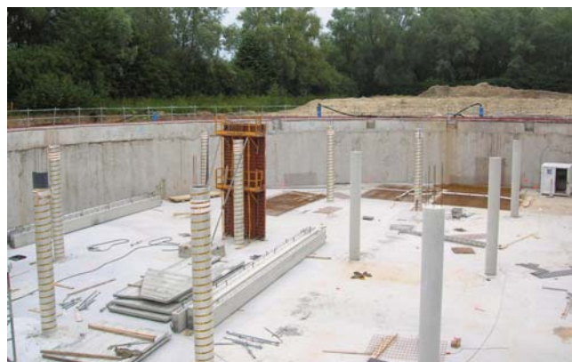
View of the 0.5m diameter columns