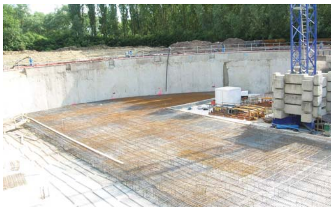
Constructing the base slab