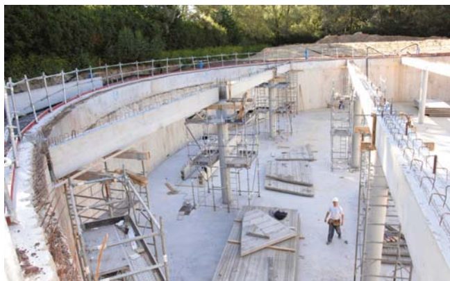
View of the prestressed beams