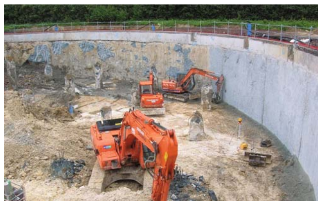
Diaphragm walls being surfaced