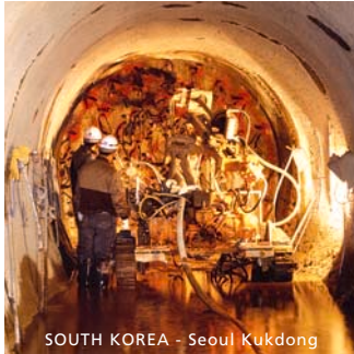
SOUTH KOREA - Seoul Kukdong