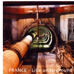
FRANCE - Lille underground