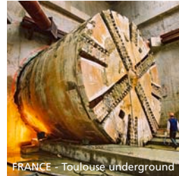
FRANCE - Toulouse underground