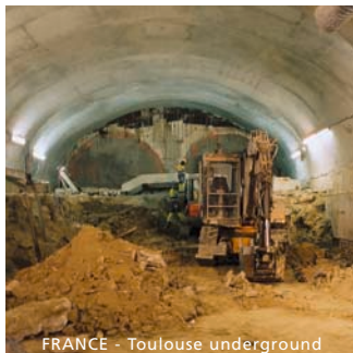
FRANCE - Toulouse underground