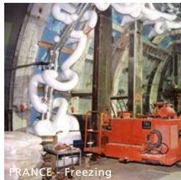
FRANCE - Freezing