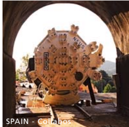
SPAIN - Collabos

Z.I. de la Pointe 31790 SAINT JORY - Tel.: +33 5.61.37.63.63 - Fax.: +33 5.64.74.90.72